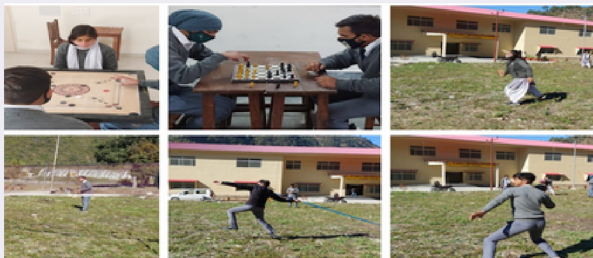
Students participating in different Sports competitions