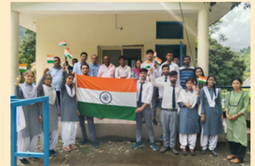
Har Ghar Tringa Campaign