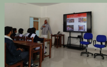
Teachers and Students participating in Anti Drugs Awareness Lecture

An anti-drug awareness lecture was organized and the same was delivered by Resource person from Prajapati Bhrankumari (Mandawali New Delhi) who informed the students the negative effects of drug use. Students benefitted from this awareness lecture.