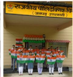
CELEBRATING 15 AUGUST AT GPC