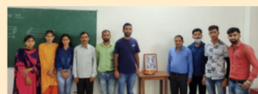
Teachers and Students Celebrating Vishwakarma Day