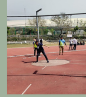
Abhishek Gulariya throwing Discus