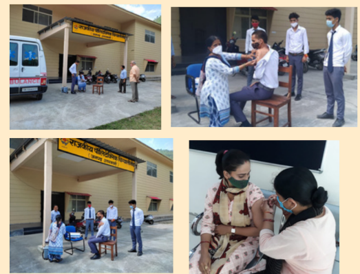
Staff and Students Vaccination was done at GPC.